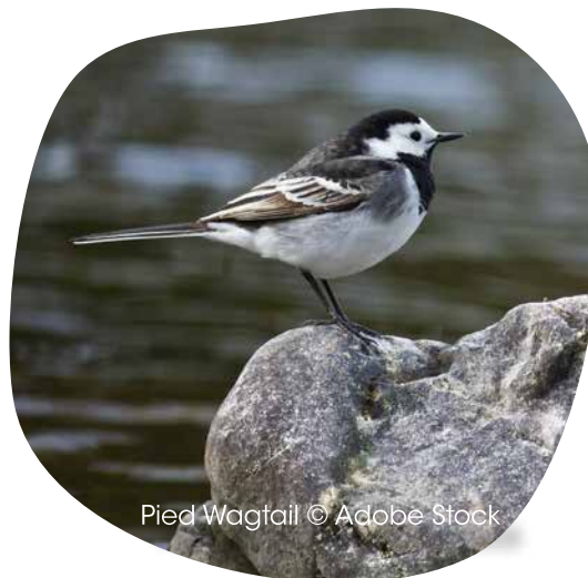
Pied Wagtail

Character - Riverside, trees, valley and very sheltered.