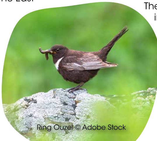
Ring Ouzel

Then back around via a downhill section, crossing Deep Ford which lives up to its name after heavy rain.