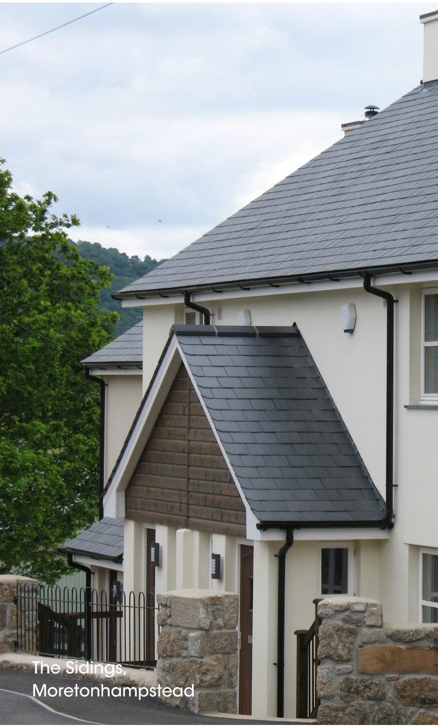
The Sidings, Moretonhampstead

The Local Plan sets out what type of development is and isn't acceptable in the National Park. The Local Plan is our first consideration when we make a decision on a planning application and its policies are likely to affect you, your community, the businesses you use and land in your area.